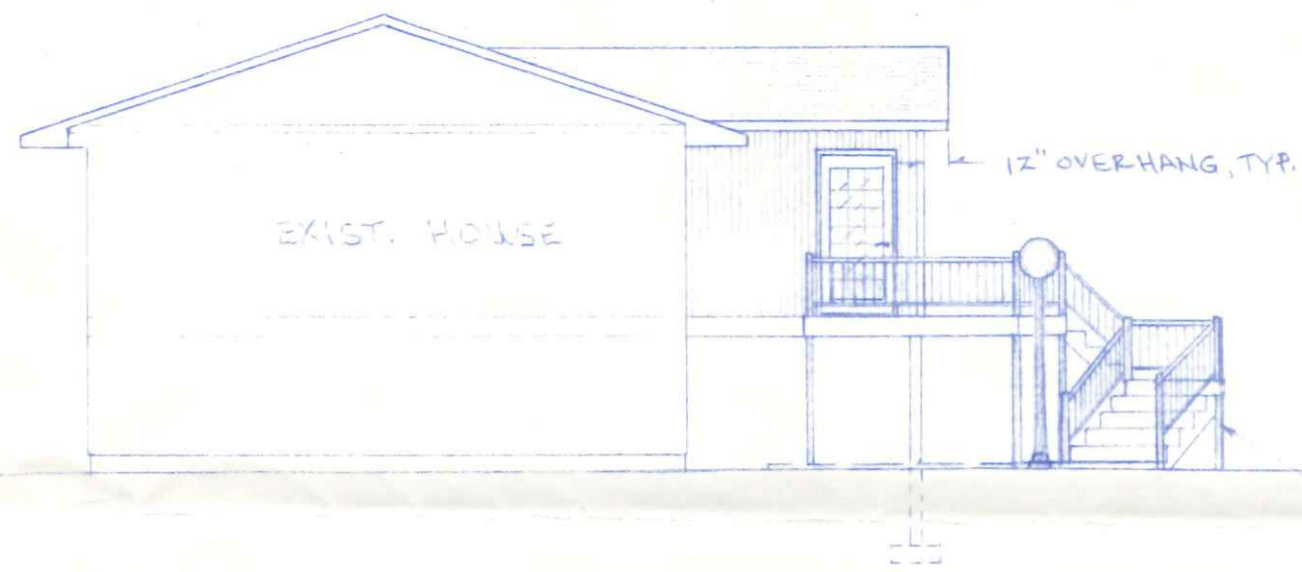
NORTH ELEVATION 1/8" = 1'-0"